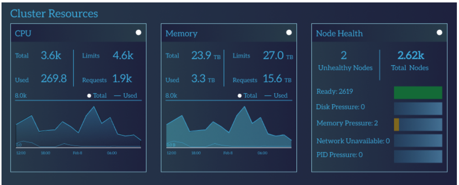
Figure 2: Pepperdata's dashboard delivers easy-to-digest high-level stats about overall cluster performance and resources, in terms of CPU, memory, and node health.